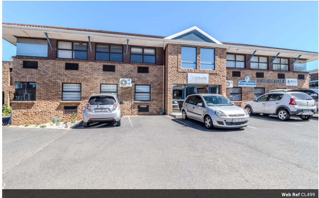
Web Ref CL499

14 Oxford Street, Durbanville 7550, South Africa